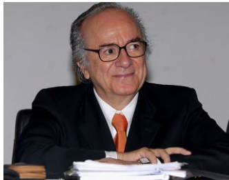
Boaventura Sousa Santos

In the capitalist societies in which we live, there is always more than one reading of the relations between the juridical and the political. What is different about such readings is what distinguishes a Left from a Right position regarding a unilateral declaration of independence. A Left position on the relations between the juridical and the political would be grounded on the following assumptions.